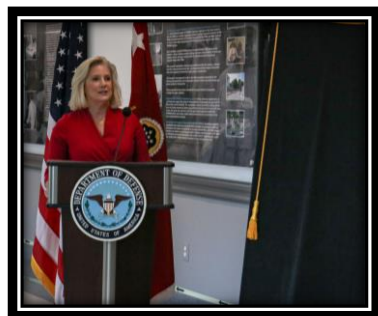
Secretary of the Army, Christine E. Wormuth at the unveiling ceremony.