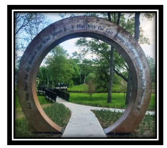
Arch in Vietnam Veterans Memorial Park in Trumbull, CT.

Independence Day is an opportune time to think about America's freedom. Each service member